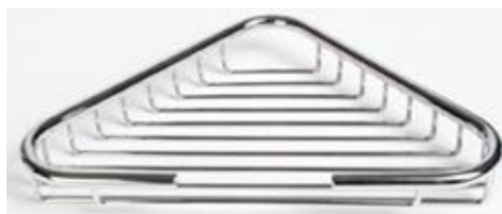
AC0964C Bright finish